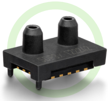
SDP3x, SDP8x: Differential pressure sensors