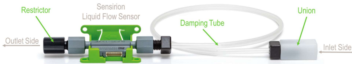
Figure 2: Components of Sensirion's pulsation damping kit (labeled in green); example setup with the SLF3S-1300F.

It can be difficult to implement effective pulsation damping for a fluidic system before you have gathered some basic experience with the concept. To assist the first steps and allow for a quick evaluation of this approach, Sensirion offers a pulsation damping kit that contains all necessary components to dampen pulsating flows for the measurement with Sensirion liquid flow sensors.